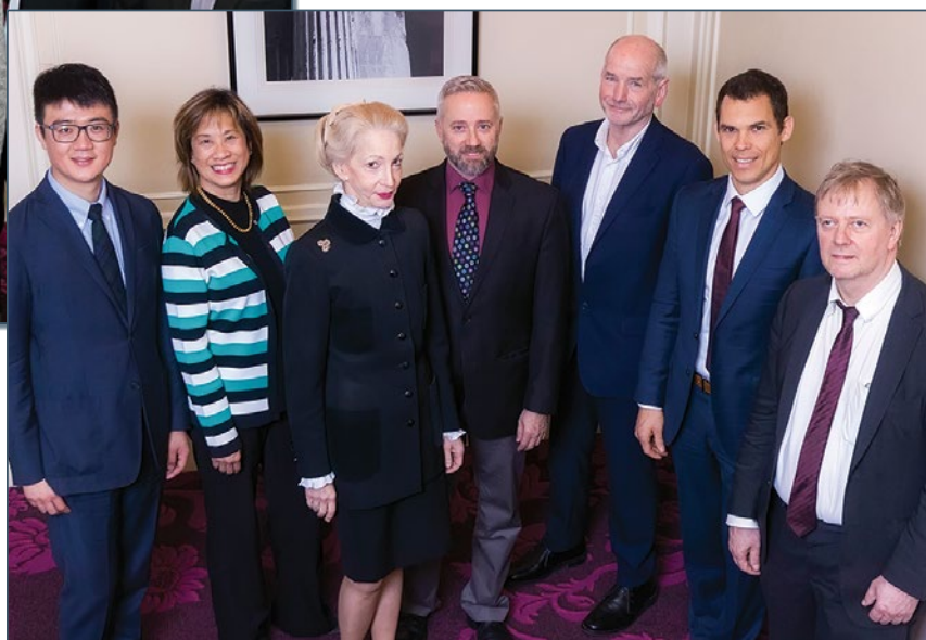
SNOMED International Management Board – April 24 to December 31, 2017